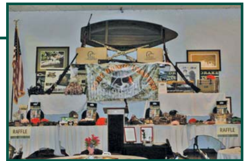
Great Tier Raffle-Fort Bragg