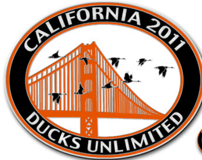
polished silver metal with 3 enamel colors